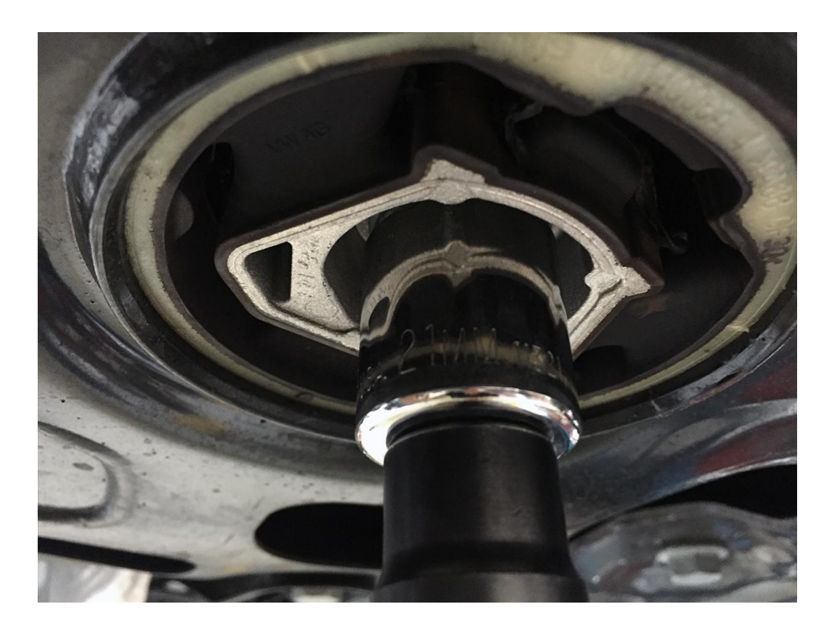
Step 4 – Remove the bolt completely in order to install the 034Motorsport MQB Audi/Volkswagen Dogbone Mount Insert.