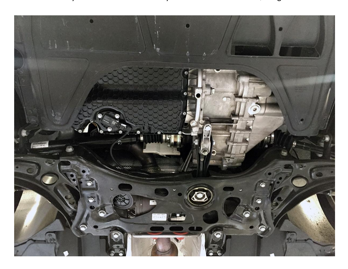
Step 2 – Locate the factory dogbone mount, and notice the 21mm bolt securing the two halves to the factory torque arm, circled in red below.