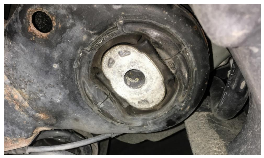
Step 3 Keep the factory washer and bolt to the side as these will be needed to reinstall.

Using an E18 Torx Socket, remove the rear subframe bolt securing the right rear portion of the subframe to the chassis.