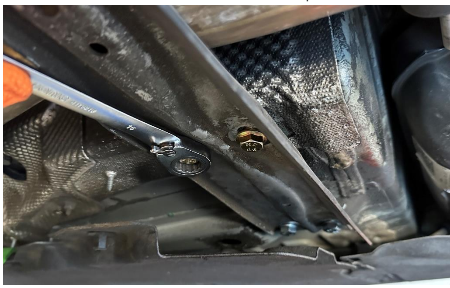
Step 5 Remove the factory chassis brace.