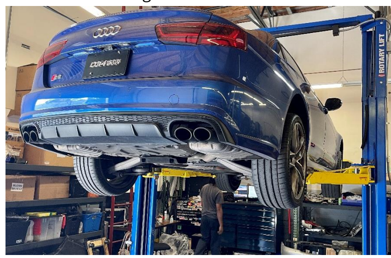
Step 2 Using a 10mm socket, remove the bellypan hardware near the factory chassis brace.

Lift the car to gain access to the underside.