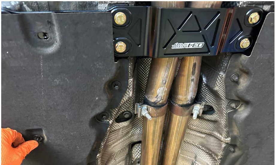
Step 9 Using a 4mm Allen, secure the bellypan to the X-Clear with the provided hardware.