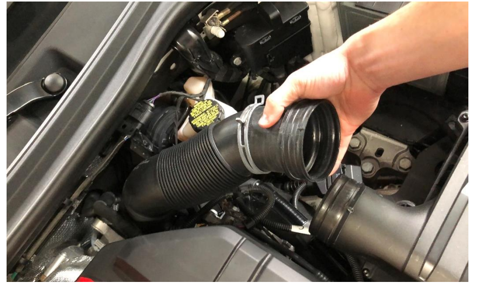
Step 6 Install the 034 intake hose into the stock location.