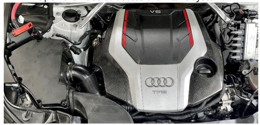
Step 2 Remove the engine cover by pulling upward.

Open the hood to access the intake system.