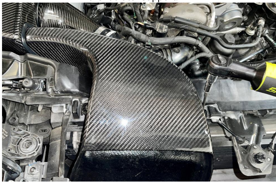
Step 16 Return the radiator cover and heed release latch.

Reuse the factory T25 Torx to secure the X34 intake duct to the radiator support.