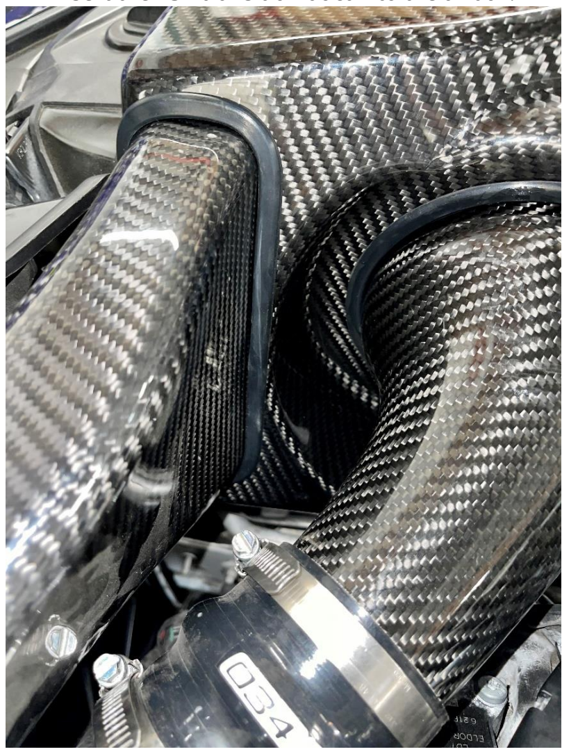
Step 14 Insert the X34 transition duct into the airbox.

Slide the airbox assembly into the factory location, making sure the rubber feet and fully seated.